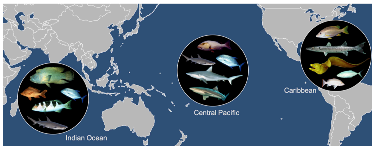
Figure 1. Images of the five top predators by biomass by three representative regions from underwater visual surveys (2005–2021).

observed in lower densities in protected areas [43]. In a comparison of fish assemblage structure across management zones of the GBR, a consistent signature existed with higher densities of multiple piscivorous fishes and lower densities of prey fishes within protected relative to less-protected areas [44]. Such evidence of prey