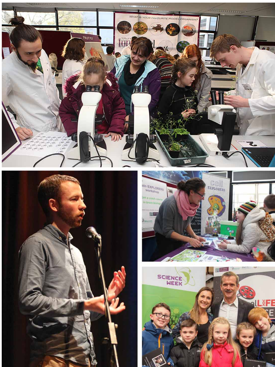
Figure 2. Researchers can engage in a diverse range of activities when starting with public engagement in science.