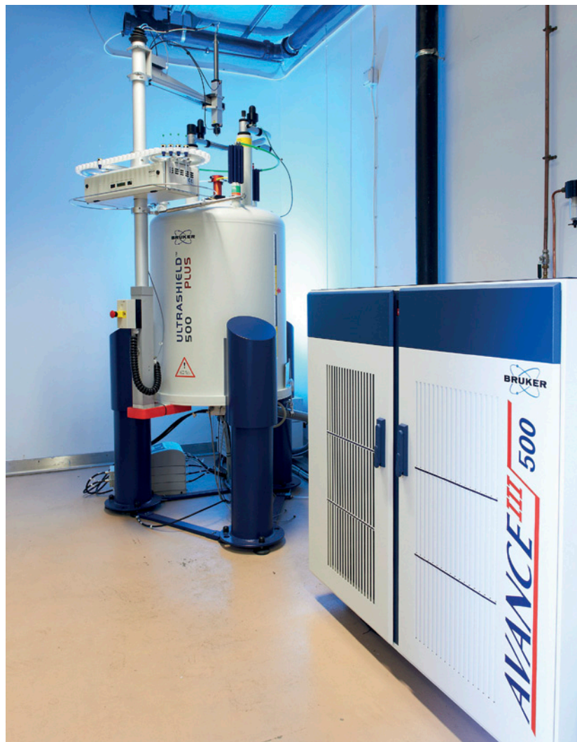
Figure 1. A 500 MHz NMR spectrometer (Material and Chemical Characterization—MC 2 , University of Bath)

NMR is not limited to hydrogen, and although some atoms do not produce an NMR response, both carbon and nitrogen have isotopes with suitable nuclei ( ^{13}\text{C} and ^{15}\text{N} , respectively), both of which are NMR active and behave in a similar way to protons. However, there are some important distinctions, not least the low natural abundance of ^{13}\text{C} and ^{15}\text{N} nuclei, and their intrinsic NMR characteristics. For carbon, the ^{13}\text{C} isotope is around 1.1% abundant, so that typically a ^{13}\text{C} spectrum is already 100-fold weaker than the proton spectrum for the same sample. For nitrogen the situation is worse, with an abundance of ^{15}\text{N} only 0.4%. On top of this, the relative NMR response compared with a proton is poor for both ^{13}\text{C} and ^{15}\text{N} , and thus natural abundance experiments on these nuclei are very difficult. In the context of proteins this means that isotopically enriched samples are desired and are usually prepared by expressing the protein in bacteria, with the isotopic labels introduced by feeding the bacteria specific nutrients. In most cases this will