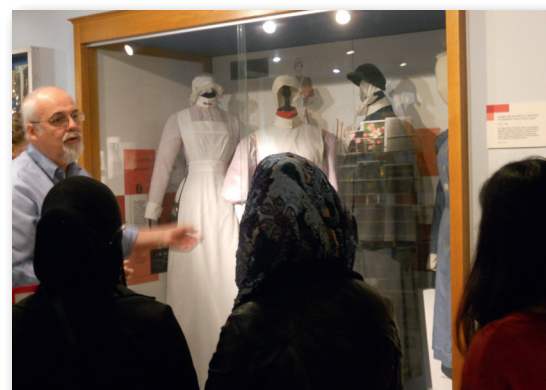
Visit to the Royal London Hospital Museum