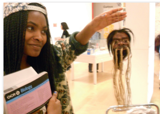
Visit to Wellcome exhibition - Medicine Now