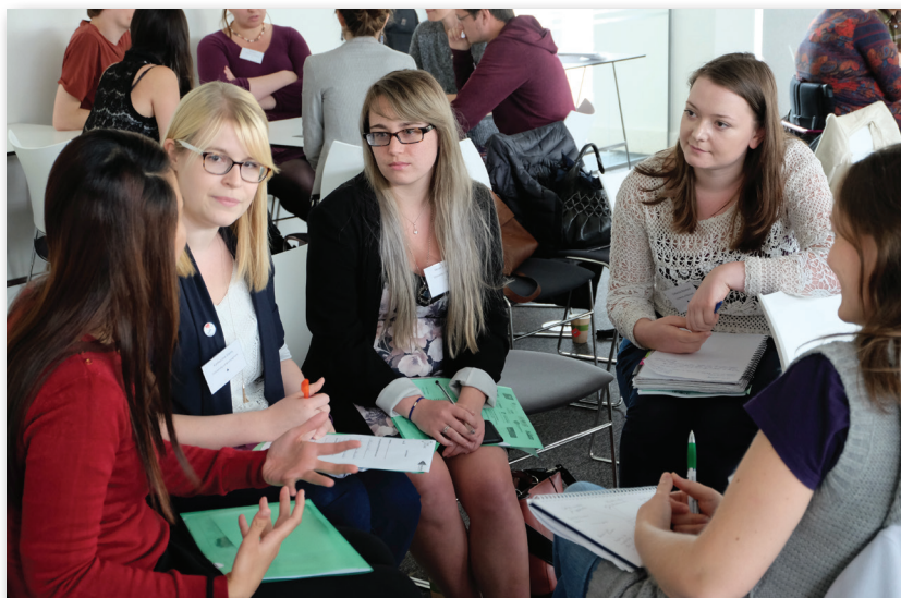
VoYS members discuss the barriers to standing up for science at a workshop in Warwick

The VoYS network has also taken on a life of its own, running dynamic campaigns which have made a real impact; highlighting the lack of evidence behind claims made by detox products, drawing attention to dodgy nutrition with a spoof diets quiz featured in the Daily Mail and calling on the WHO to condemn the use of homeopathy for serious diseases in developing countries. The WHO responded to that open letter stating clearly that it does not recommend the use of homeopathy for treating HIV, TB, malaria, influenza and infant diarrhoea.