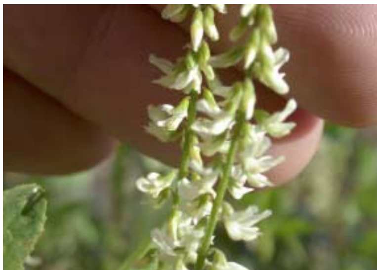
Figure 1. Sweet clover.

In 1978, two groups independently reported that warfarin acts by inhibiting vitamin K epoxide reductase, which catalyses an essential reaction in the vitamin K-dependent pathway by which clusters of glutamyl residues in certain proteins are \gamma -carboxylated ( \gamma -carboxyglutamic acid). The post-translational modification of what